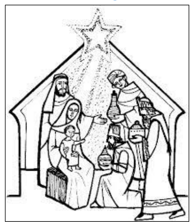
Solemnity of the Epiphany of the Lord, Year B 6-7 January 2024

Safeguarding Representative Contact: <a href="mailto:sg.ol.stanne.caversham@rcaob.org.uk">sg.ol.stanne.caversham@rcaob.org.uk</a>